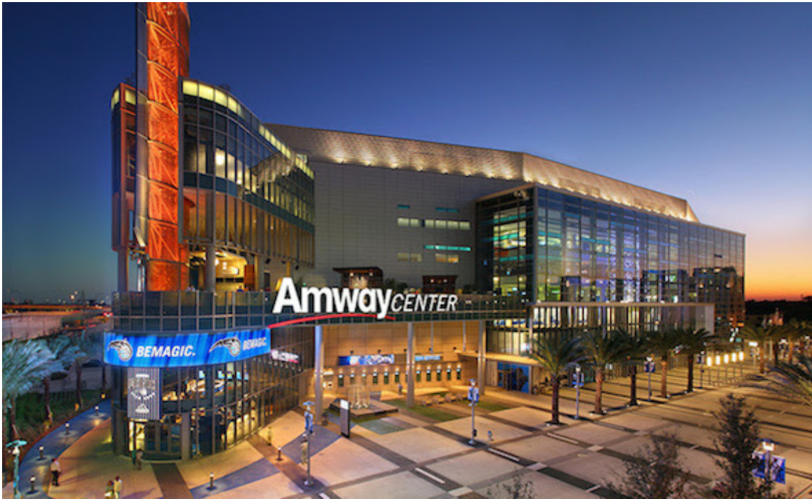
Amway Center, Orlando.