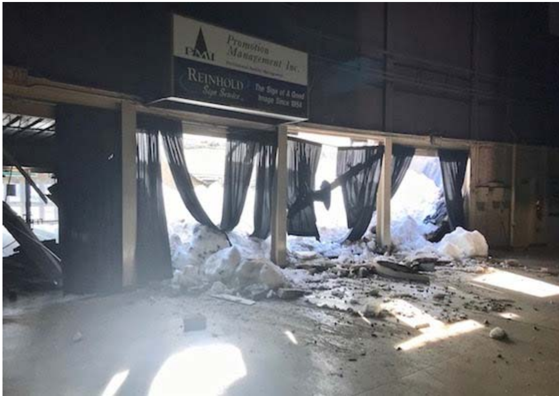
Nearly 6 feet of snow fell into the inner lobby of the Brown County Veterans Memorial Arena on April 20 when a record snowstorm pounded Green Bay, Wis.