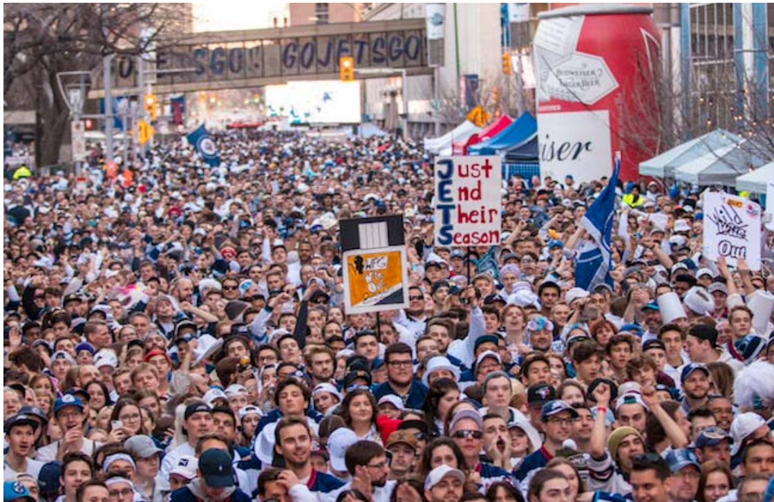
Street parties outside Bell MTS Place have been drawing thousands of Winnipeg Jets fans who want to join in the NHL playoff excitement.