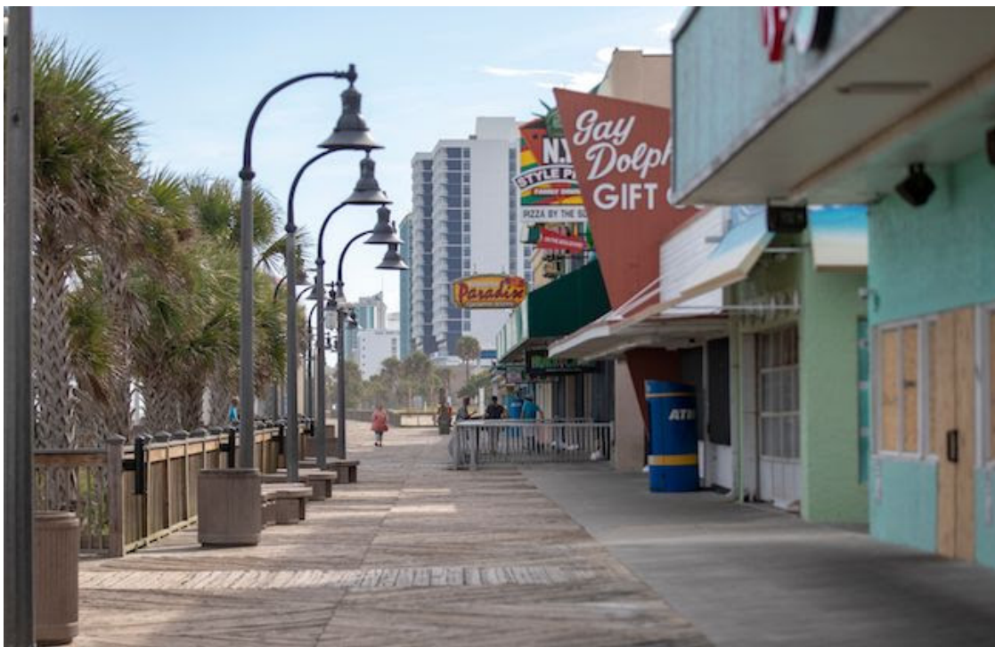
Shops were boarded up and visitors were scarce along the Myrtle Beach (S.C.) Boardwalk on Wednesday.