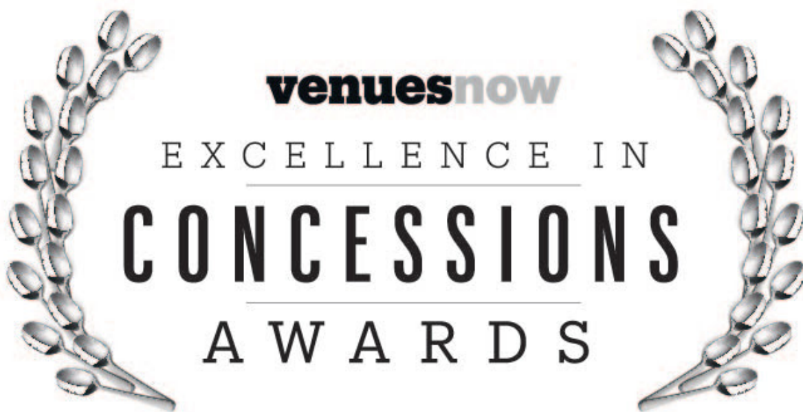
PHOTO OF THE WEEK

Live music is thriving around the globe, with U.S. clubs being exported to foreign territories in record numbers. Japanese live music club Live Roxy Shizuoka, modeled after the U.S. Roxy brand, just got new Ayrton Ghibli, MagicDot and CosmPix lighting fixtures.